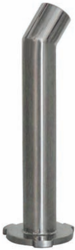
Open applicator for skin treatment

ioRT-50 x-ray therapy units are intended for superficial x-ray therapy.